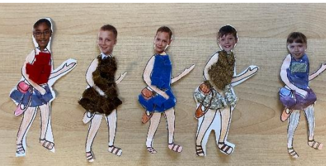
Us as David